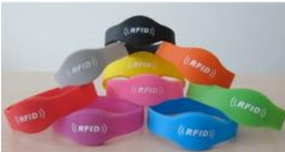
New era product: Mifare bracelets, type & RFID tags

Colombianworld offers other RFID elements to complete its portfolio of innovative income and access. Our silicone bracelets with a modern design and presented in various sizes and colors, are made of high quality materials and designed to withstand extreme temperatures and high humidity, they can be further customized with the logo and name of each company.