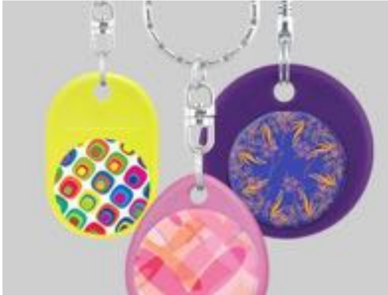
SMART KEYFOBS - ABS, encapsulated for access control and electronic payment